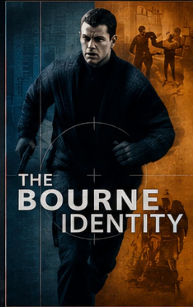
THE BOURNE IDENTITY

Lone operative on the run, searching for the truth.