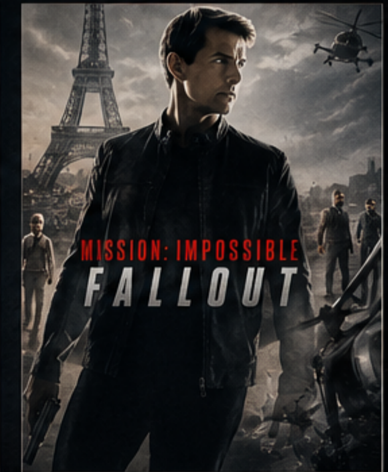
MISSION: IMPOSSIBLE - FALLOUT

Deception, intelligence games, and hidden agendas.