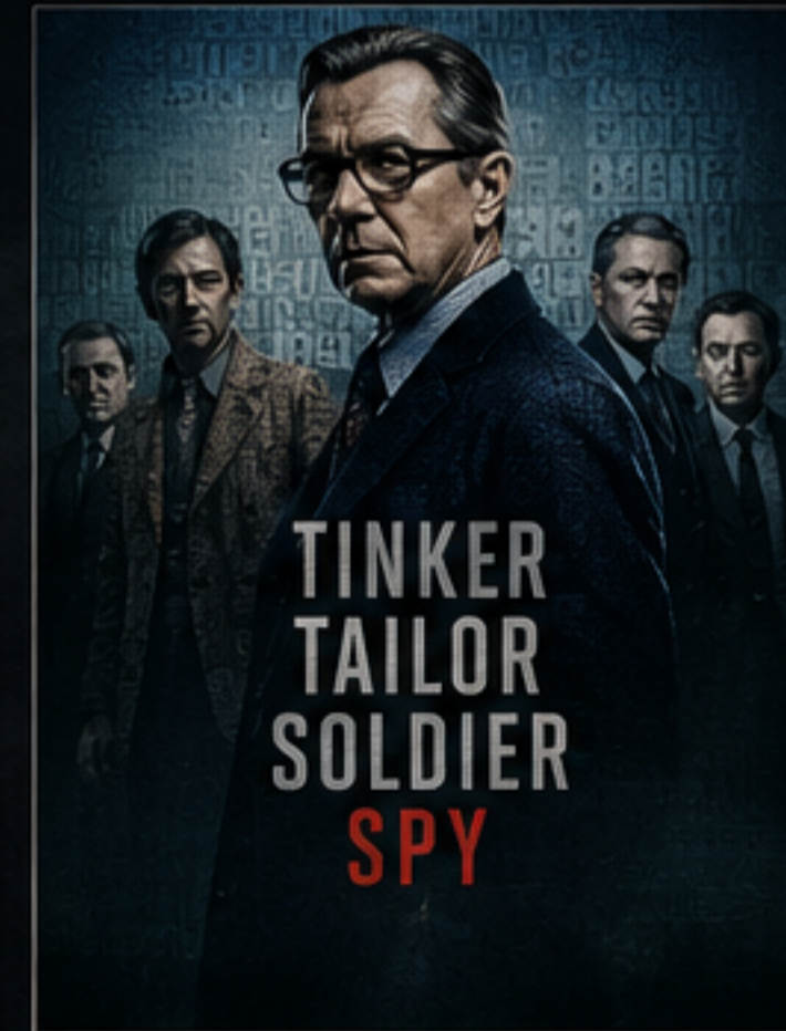
TINKER TAILOR SOLDIER SPY

High-stakes adventure, clues, and hidden truths.