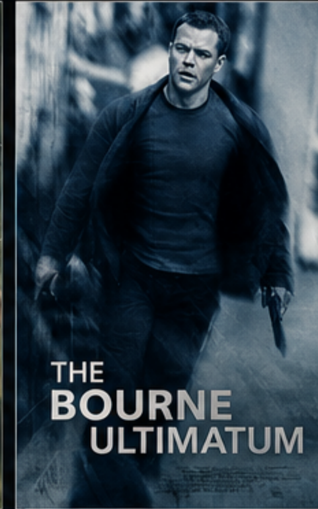
THE BOURNE ULTIMATUM

The system hunts him when he uncovers too much.